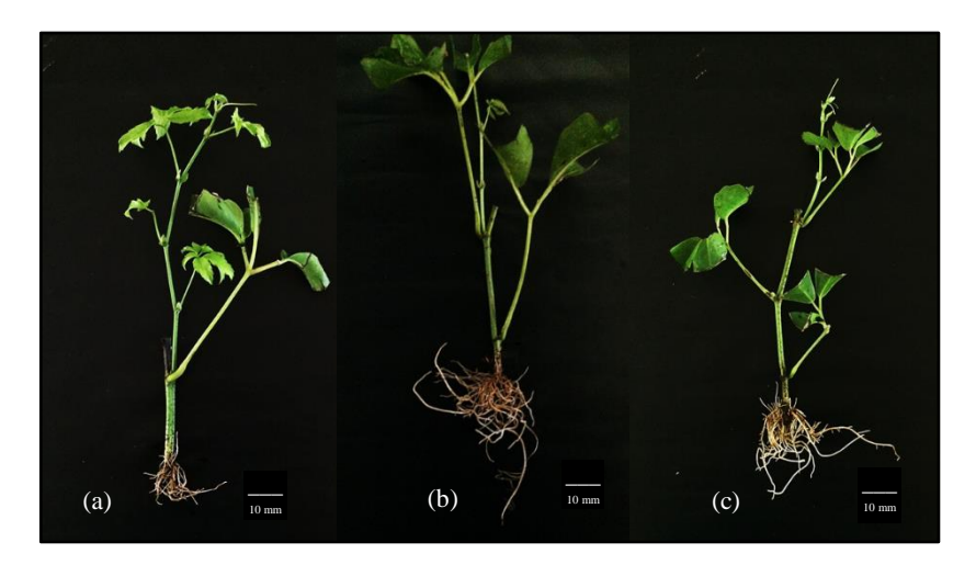
Figure 2. Rooted T. harmandii one-node (a), two-node (b) and three-node stem cuttings (c) after 33 days in the rooting bins

During the rooting observation, the stem cuttings produced shoots (Figure 2). Shoot production was high in stem cuttings with auxin application regardless of nodal segments and in multiple nodal stem cuttings without auxin application. It is perceived that the newly emerged shoots in the stem cuttings have a crucial role in the prolonged survival of the stem cuttings.